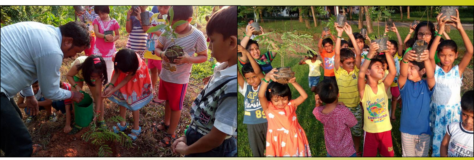
IITG Monitor ¶ Indian Institute of Technology Guwahati.