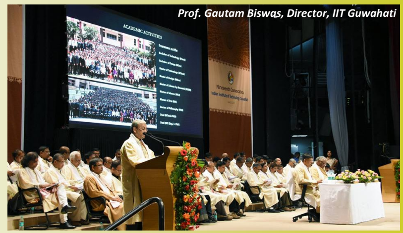
IITG Monitor ¶ Indian Institute of Technology Guwahati.