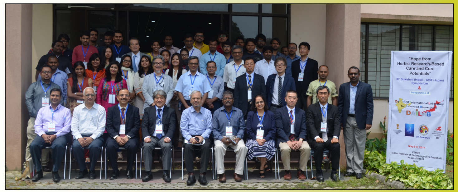
IITG Monitor ¶ Indian Institute of Technology Guwahati.

In connection with the inauguration of DAILAB, IIT Guwahati and AIST Japan jointly conducted an Indo Japan symposium on "Hope from Herbs: Research based Care and Cure Potentials" where many scientists from IIT Guwahati and AIST, Japan exchanged their ideas and discussed about future collaborations in advanced biomedical research. The symposium covered various topics of basic and translational research discussing various topics such as mortalin and cancer, CRISPcut, production of flavonoids, carotenoids, terpenoidsfrom various sources, protein aggregates as delivery vehicles, bioimaging techniques etc. This symposium was a strong initiative to discuss and start more collaborations on the potential of natural products in prevention and treatment of various chronic diseases.