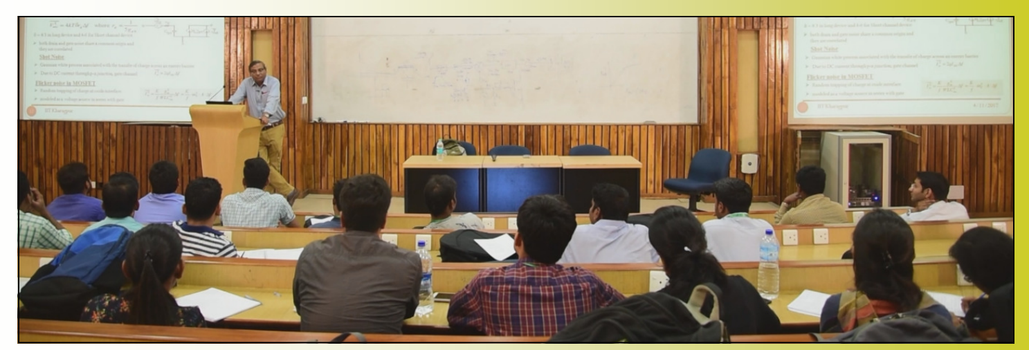
IITG Monitor ¶ Indian Institute of Technology Guwahati.

The objective of the programme was to build an air quality monitoring system based on FPGA/ASIC platform which will detect the presence of CO, CO2, NO2 gases along with temperature and humidity of the ambience around it covering an area of 100 meter square. It is intended to be deployed in various parts of the north-eastern region of the country.