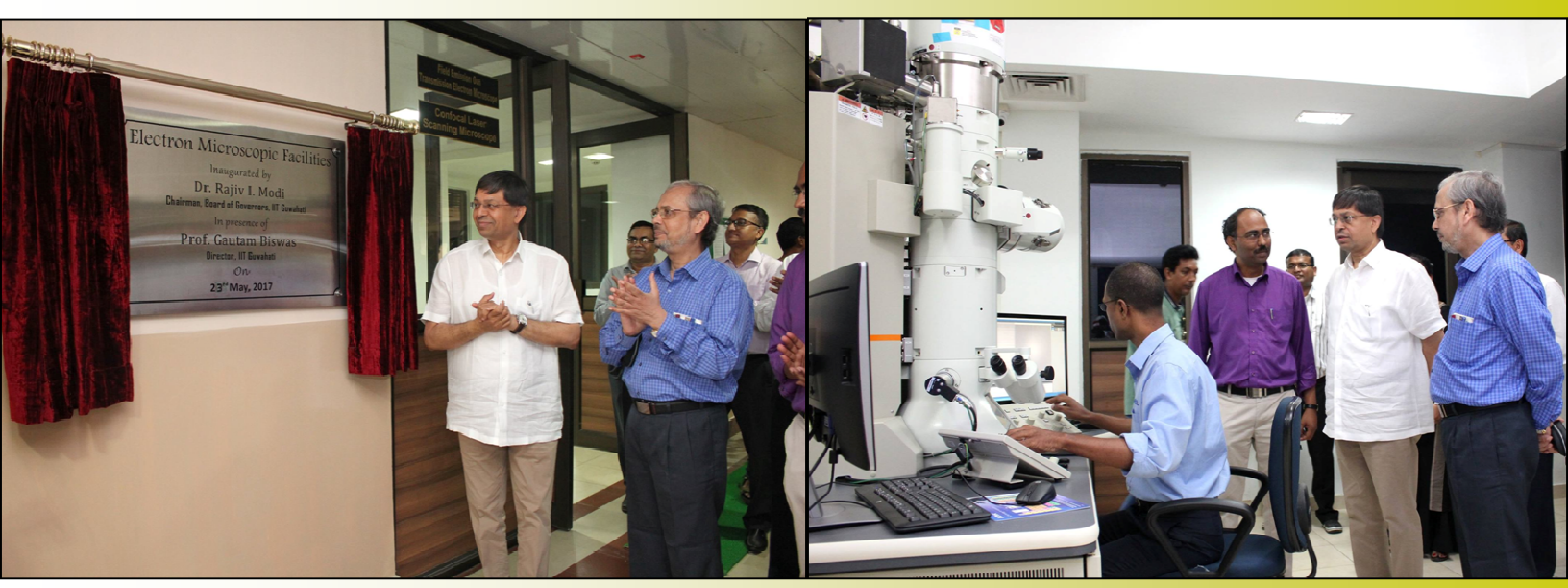
IITG Monitor ¶ Indian Institute of Technology Guwahati.

The Gemini 300 of CIF is equipped OXFORD Instruments' advanced Windowless Energy Dispersive X-ray Spectrometer (EDS) system for characterization of nano-size features. The windowless EDS is most recent technology and the this is the set-up first of it's kind in India.