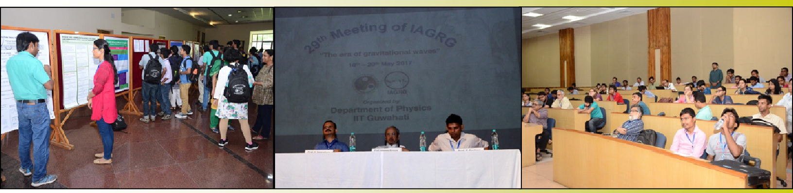
IITG Monitor ¶ Indian Institute of Technology Guwahati.