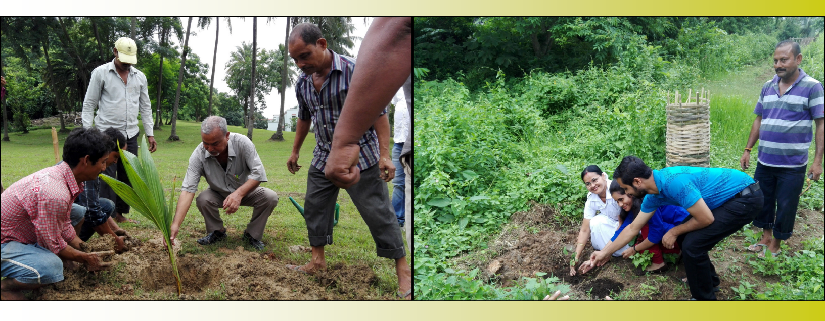
Plantation drive by the campus children

The Horticultural Wing of the Engineering Section also organized a plantation drive, with active participation of the IITG community, across the campus. Some of the glimpses of the plantation drive are shown below.